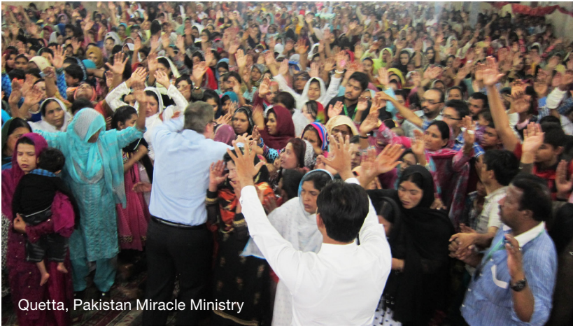
Quetta, Pakistan Miracle Ministry