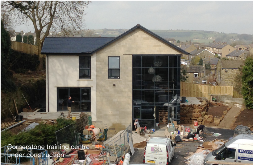
Cornerstone training centre under construction