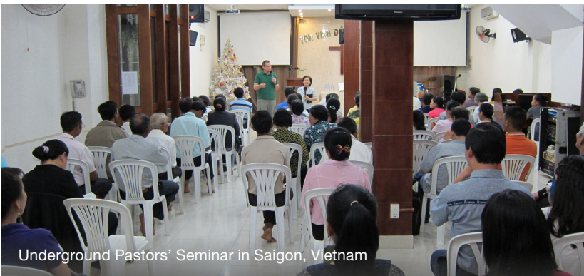
Underground Pastors' Seminar in Saigon, Vietnam

G reat Joy In The City Ministries (GJITCM) has been reaching 'closed' and 'anti-Christian' Asian nations, especially those with large Muslim populations such as Pakistan, India and Malaysia, since 2001. They also work in the communist nations of China, Vietnam and Inner Mongolia. Signs, wonders and miracles have followed the preaching of the Kingdom, resulting in over 380,000 salvations, including many Hindus and Muslims. KCM Europe has partnered with them since 2002.