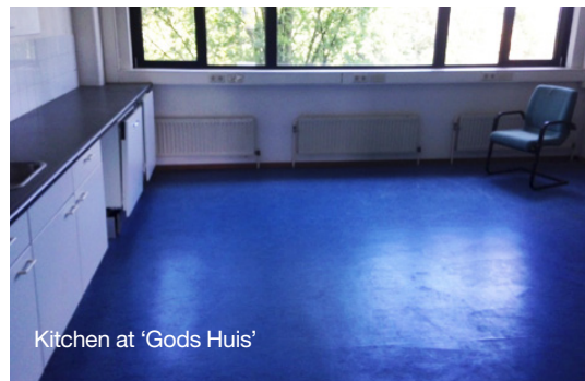
Kitchen at 'Gods Huis'