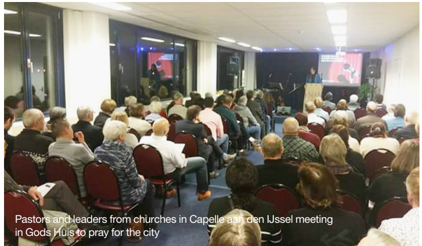
Pastors and leaders from churches in Capelle aan den IJssel meeting in Gods Huis to pray for the city