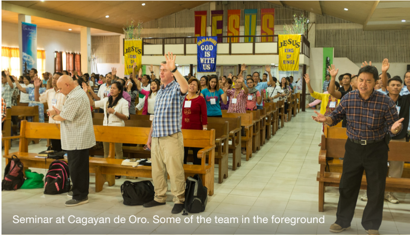
Seminar at Cagayan de Oro. Some of the team in the foreground