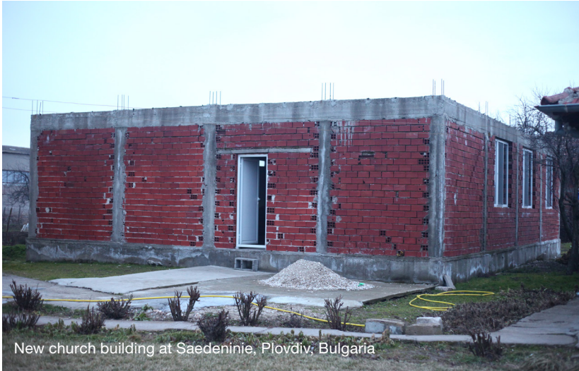
New church building at Saedeninie, Plovdiv, Bulgaria