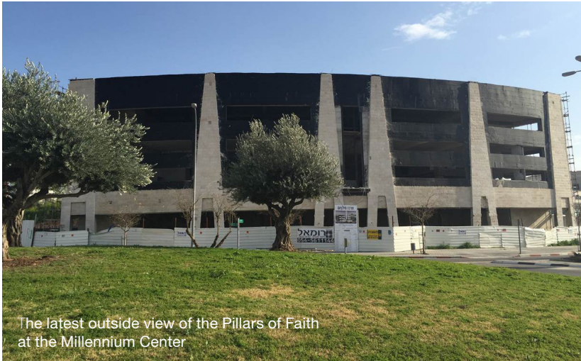
The latest outside view of the Pillars of Faith at the Millennium Center